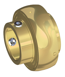
UC200MZ2RF "RF" Contact Seal Zinc Protected Wide Inner Ring Set-Screw Locking