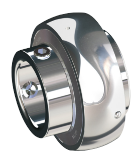
MUC200RF "RF" Contact Seal Stainless Steel Wide Inner Ring Set-Screw Locking

PH: (800) 882-8642 • FAX: (847) 759-0630 www.amibearings.com