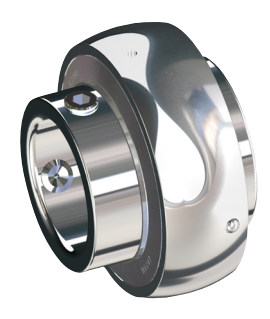
UC200MZ20RF "RF" Contact Seal Kanigen Protected Wide Inner Ring Set-Screw Locking