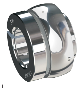
"RF" Contact Seal Kanigen Protected Wide Inner Ring Accu-Loc

AMI's unique design allows for cost effectiveness