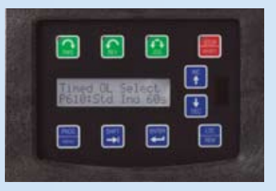
Vacon's user-friendly keypad makes operation simple.