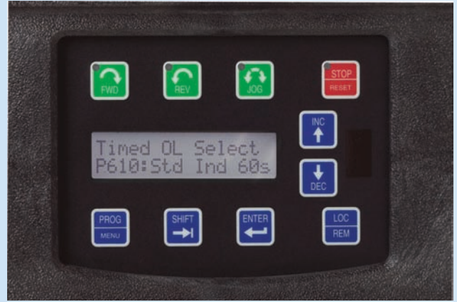
Vacon's user-friendly keypad makes operation simple. The easy-to-read display communicates status information.